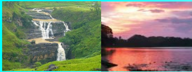
Hills, waterfalls, sunset; the scenic beauty.....