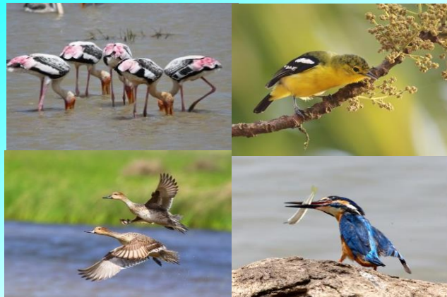
A haven for many endemic and migrant birds...