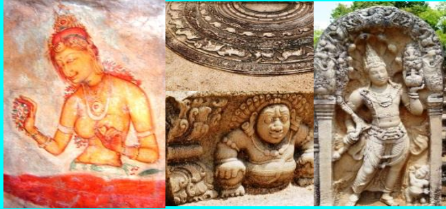
Sigiriya frescos, moon-stone and guard-stones; symbols of the amazing heritage of Sri Lanka

Visit and experience the glory, rich culture and heritage of Sri Lanka, the Pearl of the Indian ocean